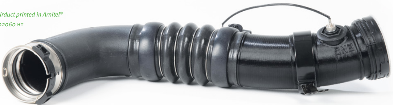
Air duct printed in Arnitel® ID2060 HT